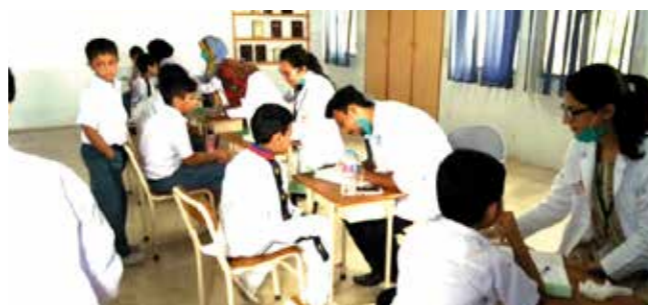
cause of oral health awareness. The activity was sponsored by Colgate Palmolive who distributed certificates amongst participants as well.

The Department of Community and Preventive Dentistry actively involved the students of second year BDS. The students visited various private and public schools in the vicinity where they examined up to 5500 school children under the supervision of senior faculty. Lectures were delivered with aims of educating teachers and encouraging them to take up the