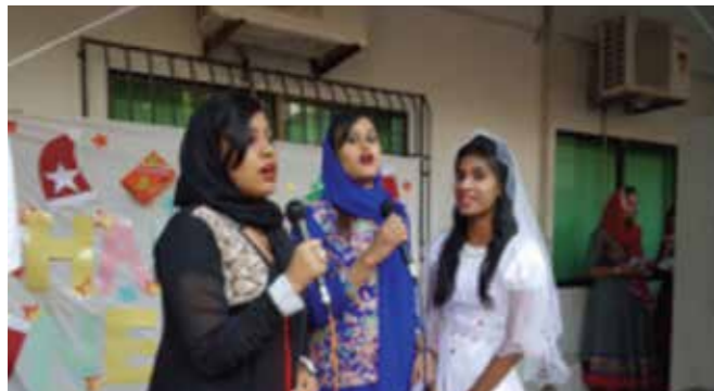
Christmas festive was celebrated on 23 January 2017 with