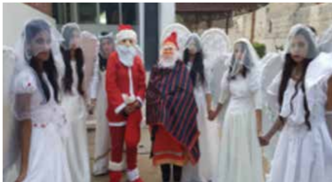
great zeal and enthusiasm at the ZCoN.